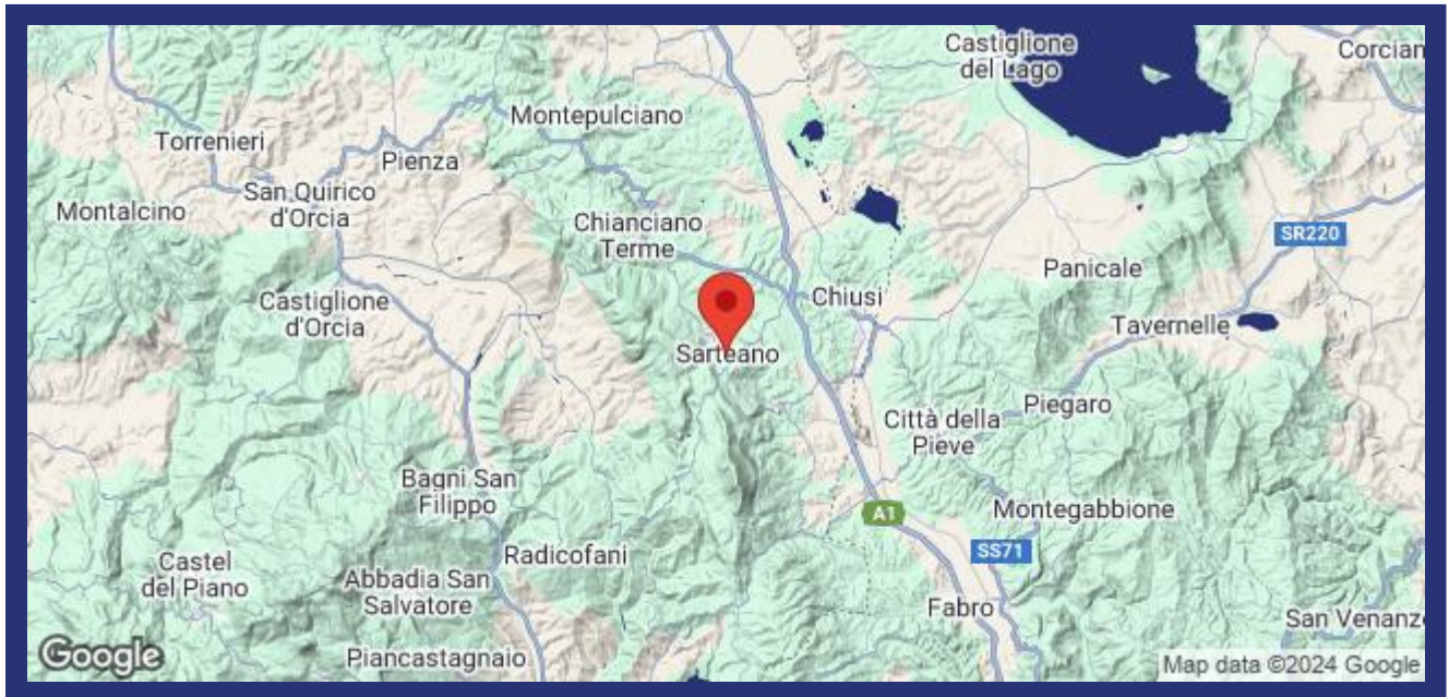
(Map does not indicate the exact location of the property)