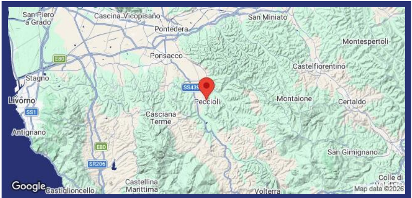
(Map does not indicate the exact location of the property)