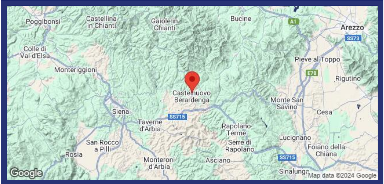
(Map does not indicate the exact location of the property)