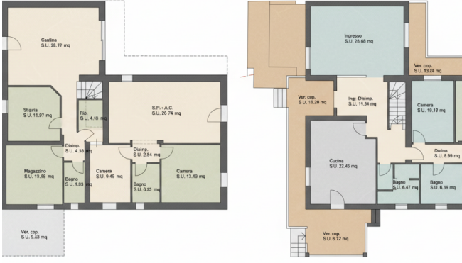
PIANTA PIANO SEMINTERRATO Scala 1:100