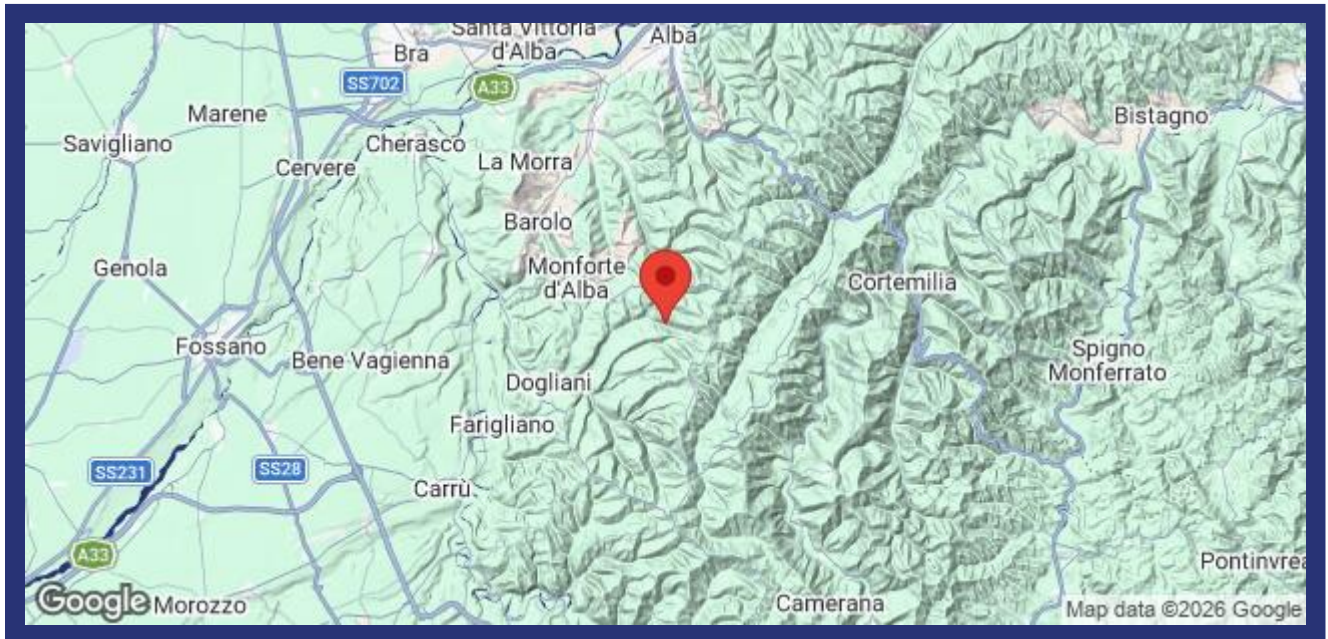
(Map does not indicate the exact location of the property)