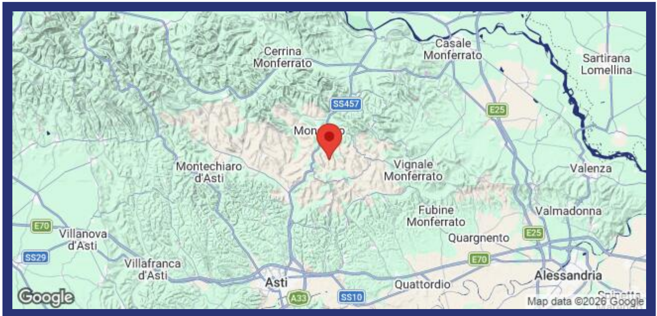
(Map does not indicate the exact location of the property)