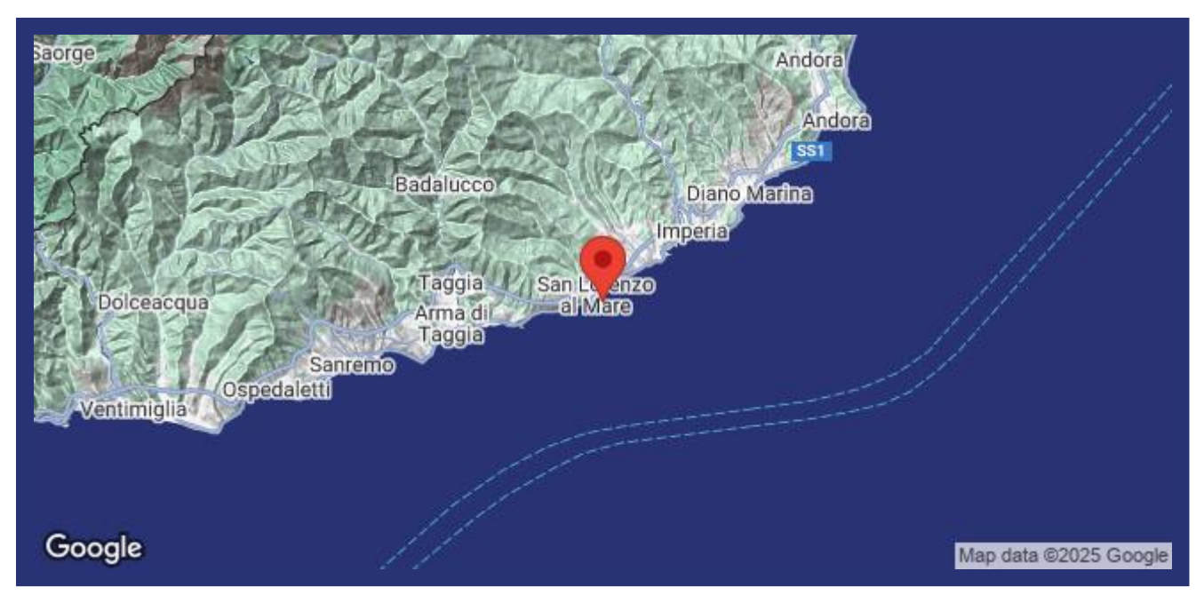
(Map does not indicate the exact location of the property)