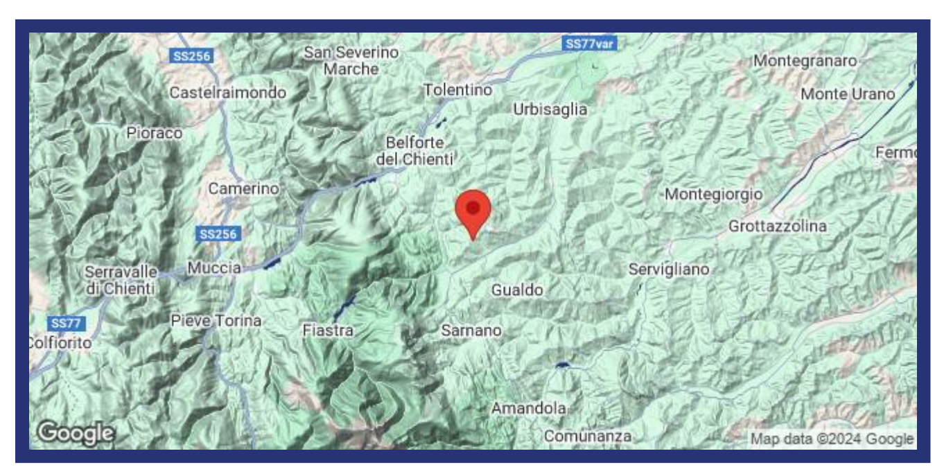
(Map does not indicate the exact location of the property)