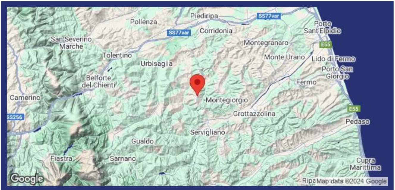
(Map does not indicate the exact location of the property)