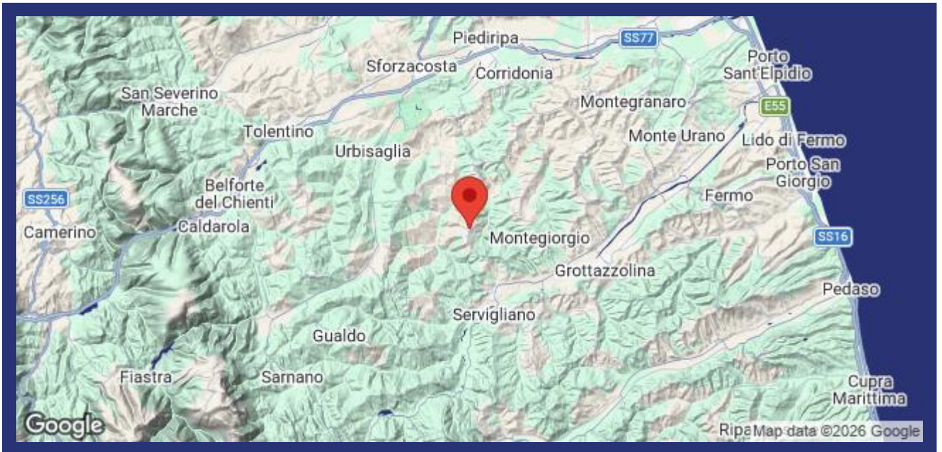
(Map does not indicate the exact location of the property)